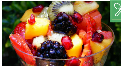
A very light and delicious fruit dessert with a little twist. A perfect way to welcome Spring!

If you have any questions, need any additional information or want to schedule a consultation, contact Clean Bee today. We are always happy to help and serve you.