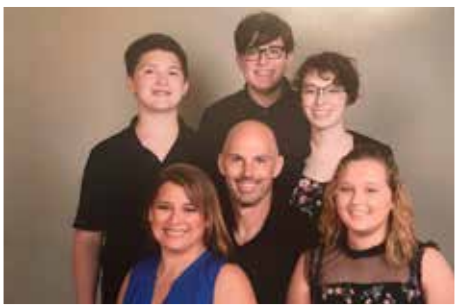
The Meintz Family

December Special 11% off your next cleaning performed in your home or business. Free pick up and delivery of area rugs to be cleaned at The Cleaning Studio.