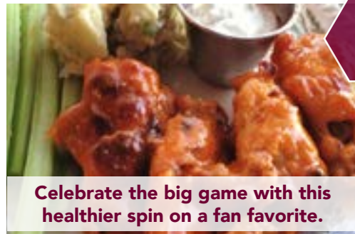
Celebrate the big game with this healthier spin on a fan favorite.

Husbands, the best way to remember Valentine's Day is to forget it... once!