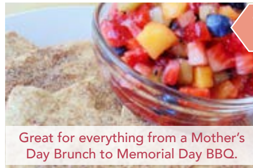
Great for everything from a Mother's Day Brunch to Memorial Day BBQ.

Mom, what's it like to have the best kid in the world? I don't know. Go ask your grandparents.