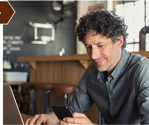
Selling your old smartphones cuts down on clutter and adds a little extra money to your pocket.

gram but nearly every major retailer and phone company, such as Best Buy, AT&T or Verizon, will often offer an option to trade a phone in to reduce the cost of an upgraded phone. Although these are the most accessible options, consumers can usually squeeze a little more value from their device by selling it themselves on sites like eBay, Swappa, or Gazelle if they are willing to do a bit more research and legwork.