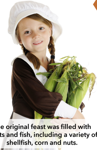
The original feast was filled with meats and fish, including a variety of shellfish, corn and nuts.

Forget the pumpkin pie. If you were a pilgrim or a Wampanoag at the Plymouth Colony in 1621, you would have feasted well for three days but you wouldn't have ended with pie.