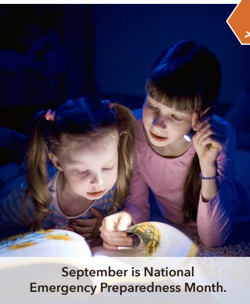
September is National Emergency Preparedness Month.

Create an emergency preparedness kit with these items: