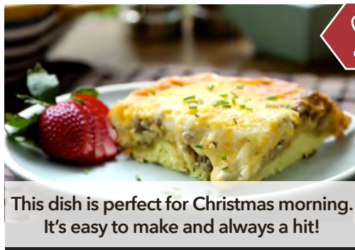
This dish is perfect for Christmas morning. It's easy to make and always a hit!