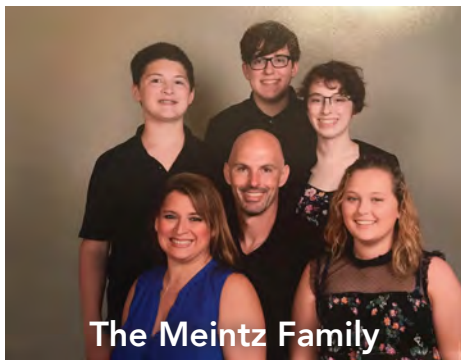
The Meintz Family

Carpet cleaning Upholstery cleaning Area rug cleaning Tile & Grout cleaning Wood floor cleaning Stain Protection