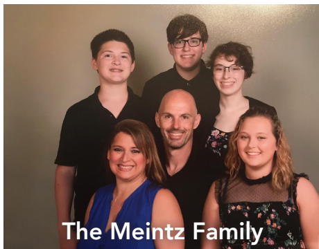
The Meintz Family

Carpet cleaning Upholstery cleaning Area rug cleaning Tile & Grout cleaning Wood floor cleaning Stain Protection