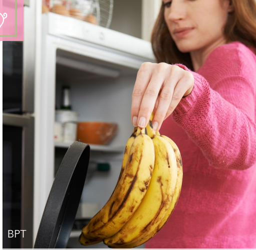
Take a peek inside the waste bin in the average American kitchen and there's a good chance that you'll find moldy bread and rotten fruits, among other things.

Forego those fresh smells and keep more money in your bank account!