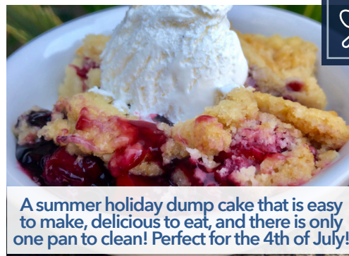
A summer holiday dump cake that is easy to make, delicious to eat, and there is only one pan to clean! Perfect for the 4th of July!

Why do bees have sticky hair? They use a honey comb.