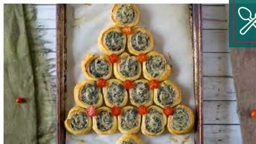
Puff pastry pinwheels are a great appetizer especially during the Christmas season, you can arrange them to form a Christmas tree.