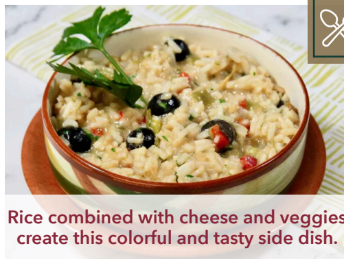
Rice combined with cheese and veggies create this colorful and tasty side dish.