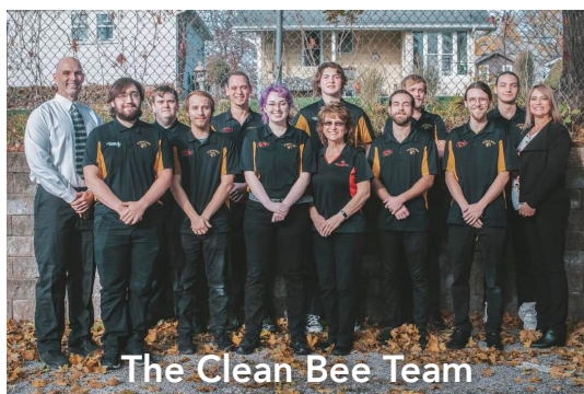
The Clean Bee Team

Carpet Cleaning Upholstery Cleaning Area Rug Cleaning Tile & Grout Cleaning Wood Floor Cleaning Stain Protection