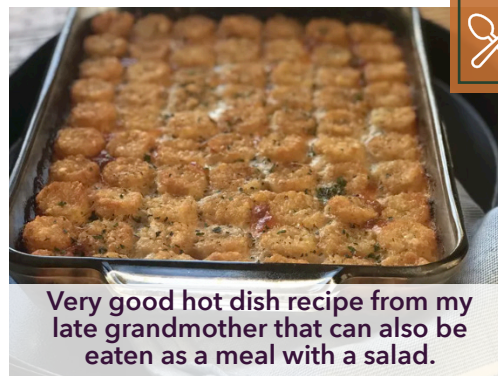
Very good hot dish recipe from my late grandmother that can also be eaten as a meal with a salad.

They're all girls, otherwise, they would be uncles!