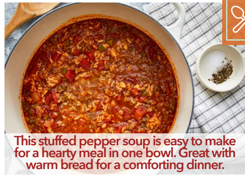
This stuffed pepper soup is easy to make for a hearty meal in one bowl. Great with warm bread for a comforting dinner.

Why do some fish live in salt water? Because pepper makes them sneeze.