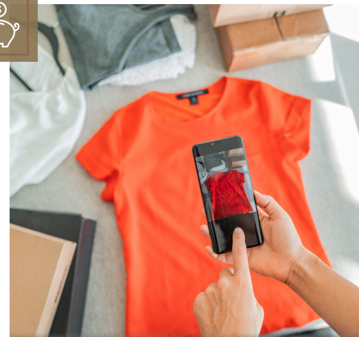
The Internet is great for a few things: Doug the Pug's Instagram, two-hour delivery, spaghetti sauce recipes and the life story of the heirloom tomato. Plus, another thing: making money!

9. Shopify is used for creating your own store. For only $29 a month, you can set up your own website with a shopping cart and link out to other online sites, like Amazon or eBay.