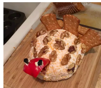
Recipe courtesy allrecipes.com