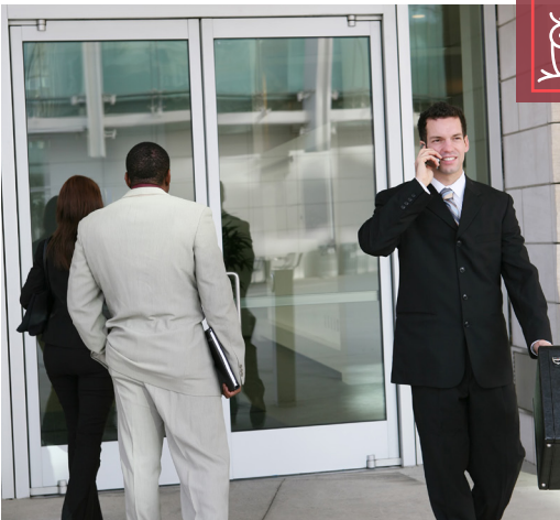
A tailgating attack (or piggybacking) is a physical security breach where an unauthorized person follows an authorized person into a restricted area

Simple courtesy seems benign but it puts everyone at risk.