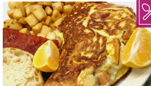
A delicious crab omelet recipe made with Dungeness, mushrooms, and Swiss cheese.

How does Darth Vader like his toast? On the dark side!