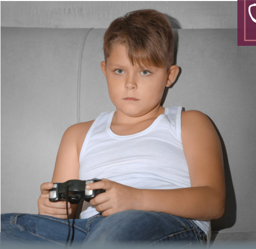
Childhood obesity is not just a cosmetic concern; it is a profound and rapidly escalating global public health crisis, rightly termed a SILENT EPIDEMIC .

In 2024, 35 million children under age five were classified overweight. Understanding this crisis requires moving beyond the simple "eat less, move more" and researching the genetic, environmental, social, and psychological factors that contribute to this disease is crucial.