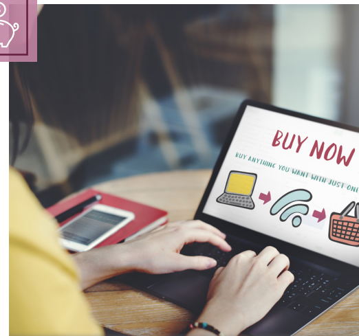
Are you an impulse spender? It turns out you're not the only one. Millions of Americans make unnecessary purchases every day.

6. Track Spending and Urges – Another great way to discourage spending is to keep track of everything you purchase during the challenge. Write your expenses down in a journal or use an app or spreadsheet to gain a better understanding of where and how you shop.