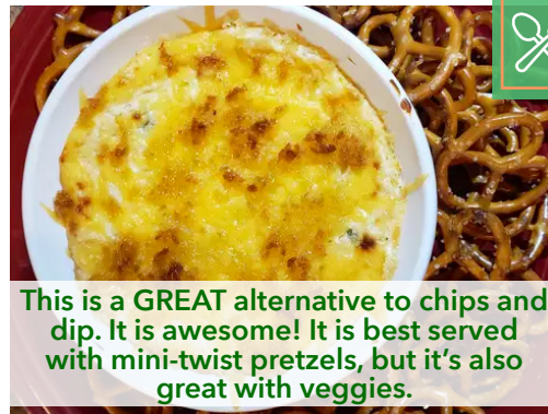
This is a GREAT alternative to chips and dip. It is awesome! It is best served with mini-twist pretzels, but it's also great with veggies.

What did the mama cow say to the calf? It's pasture bedtime!