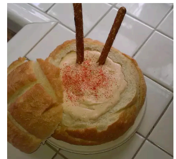
Recipe courtesy allrecipes.com

Prep Time: 10 mins Cook Time: 1 hr Total Time: 1 hr 10 mins